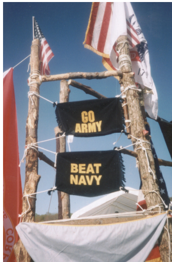
A gateway from the 41 st Camporee, submitted by Boy Scout Troop 125, Commack, NY